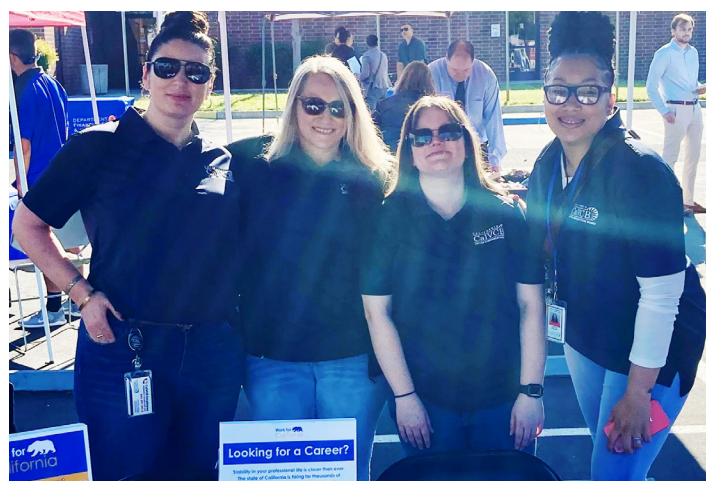
Our Human Resources team tabling at a job fair.

CalVCB enhanced recruitment efforts by participating in both virtual and in-person job fairs beginning in September 2023. Over a nine-month period, CalVCB attended 11 employment events. As a result, high-quality candidates have filled much-needed positions, and the department's vacancy rate has dropped to nearly 8%, the lowest level in years.