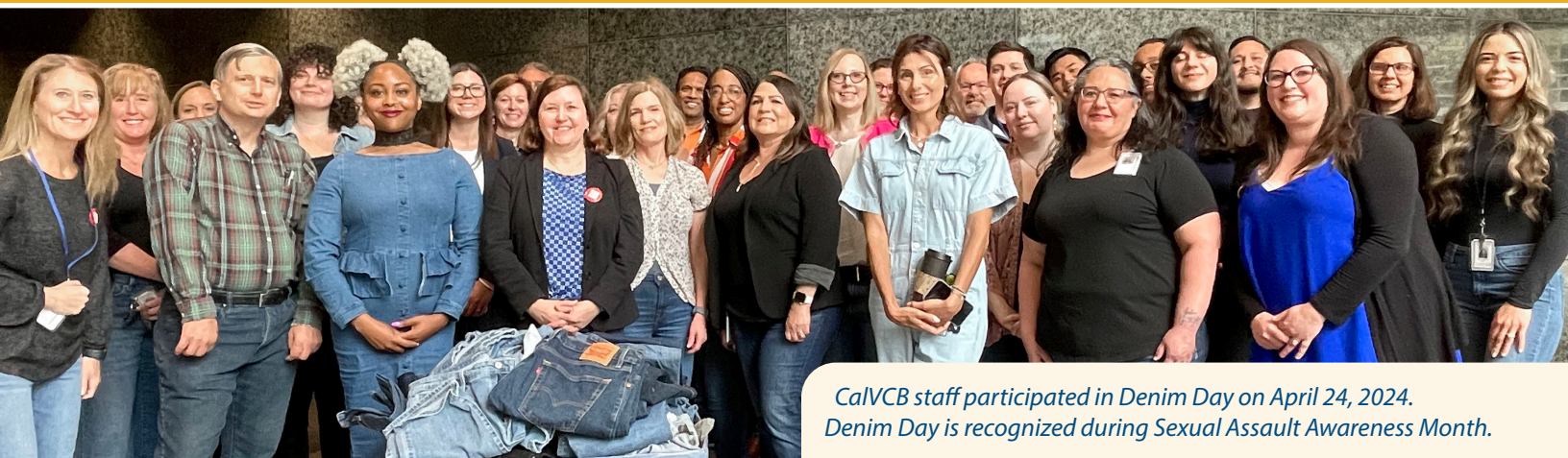
CalVCB staff participated in Denim Day on April 24, 2024. Denim Day is recognized during Sexual Assault Awareness Month.

The CalVCB team works diligently to help victims across California. Every team member contributes to the success of our organization whether they work with victims and the community directly or assist behind the scenes.