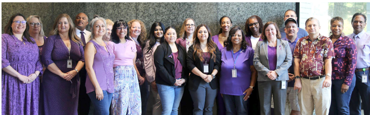
CalVCB staff participated in Purple Thursday, a national day of action to show support for domestic violence survivors and commitment to ending domestic violence.

During Fiscal Year 2023-24, CalVCB recognized employees from multiple divisions for their contributions to victim services, their dedication to California, and their collaboration with others in the organization. Employees were recognized for their outstanding teamwork, identifying solutions and efficiencies, going above and beyond when helping victims, and cross-divisional collaboration. ■