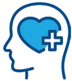
Mental Health Bills

Up to 60 sessions, not to exceed $10,000