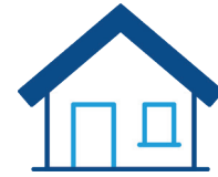
Home Security Relocation Bills