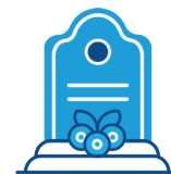
Funeral & Burial Bills

Lost income for legal dependents of a direct victim who is injured or dies